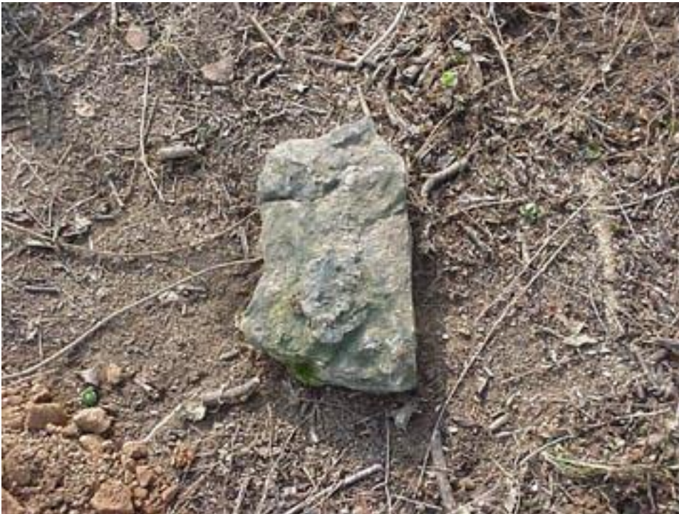
Figure 3. Field Stone Found Adjacent to Headstones. 37 x 19 cm.