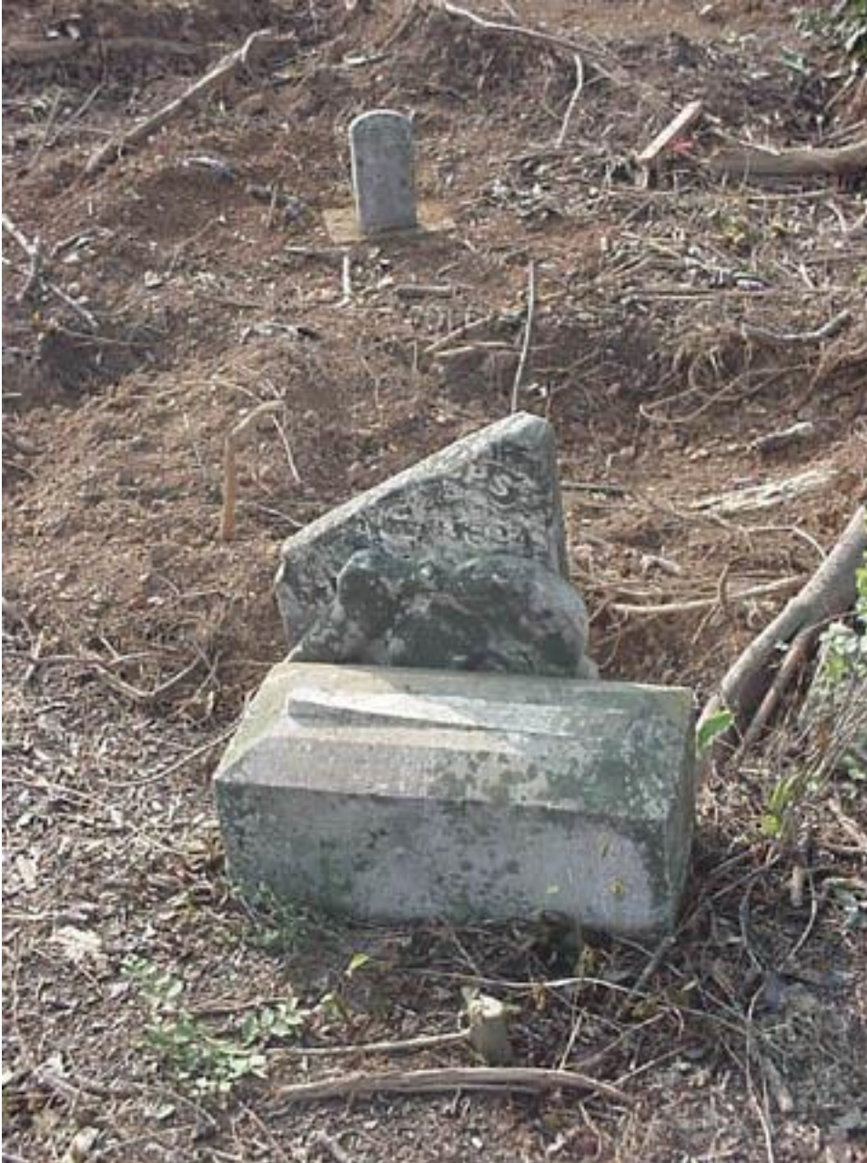
Figure 4. North Headstone and Footstone (B.F. Nabors, d. 1888).

were put in. Both headstones lacked any subsurface elements, and were simply resting on the surface. This may account for the slightly different orientations of the north headstone base and its companion footstone (see Figure 4). The base of the south headstone (“Benj Nabors”) measured 50 x 26 x 20 cm, with the top of the rounded headstone extending 58 cm high. The B. F. Nabors’ headstone base was larger, measuring 56 x 25 x 22, as was his more ornate headstone, which extending 92 cm above the top of the base. The centers of the headstone foundations were 2.0 m apart, while the footstone centers were 2.10 m