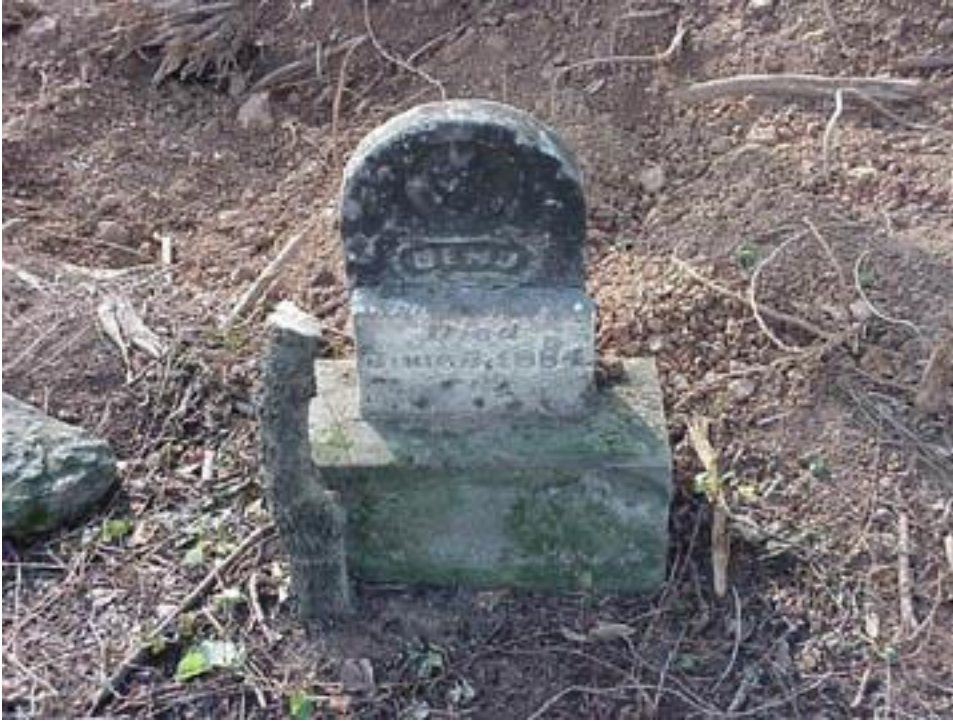
Figure 2. Southern Headstone (Benj. Nabors, d. 1884), facing east.