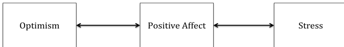
Figure 2 Mediated Model

The objective of this study was to build a better framework for understanding how optimism, equity sensitivity, and stress were related. Strong relationships were found across the variables. Optimism was a predictor of stress after controlling for positive affect. Positive affect did predict stress after controlling for optimism. This result did partially support the original hypothesis. Optimism did not predict this relationship when the SIG scale measured stress. This may be due to the different focuses of the SIG and the PSS. The SIG is a stress scale measuring work stress. The PSS measured general perceptions of stress. The results indicated that positive affect ( \Delta R^2 = .16 ) is a more proximal predictor to stress than optimism ( \Delta R^2 = .02 ). One explanation is optimistic individuals generally have high levels of positive affect, which in turn helps buffer against stress. Therefore a potential new framework for the optimism and stress relationship could involve positive affect as a mediator (See Figure 2).